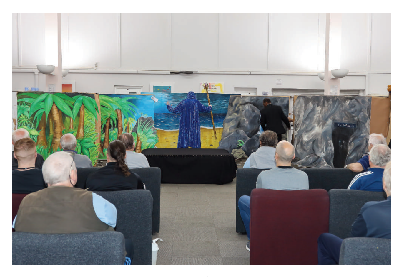
Emergency Shakespeare performs The Tempest, 2022

Since the formation of the company in early 2019, over 50 men have been members and we have performed Macbeth, Othello, The Tempest, and Julius Caesar, with rehearsals for King Lear currently underway. During Covid-19 there was an enforced break in activities where rehearsals were suspended, and the initial return to the prison was carefully managed in wing cohorts, impacting on the number of productions we could stage. We stage four performances of each production: three for other prisoners, staff members, and invited guests, and a fourth which is for the men's families. Sign-up sheets on the wings generate hundreds of names of those who would like to watch a production, and feedback from those who attend is overwhelmingly positive. As one audience member wrote, it is "wonderful to have the normality of being able to see live theatre". Staff are encouraged to attend, although in reality few are able to free themselves from their required duties, and there remains some scepticism from some uniformed staff (although that is slowly being eradicated as we encourage more of them to join us for rehearsals and performances). We also invite academics, theatre practitioners, local dignitaries (such as the Mayor and