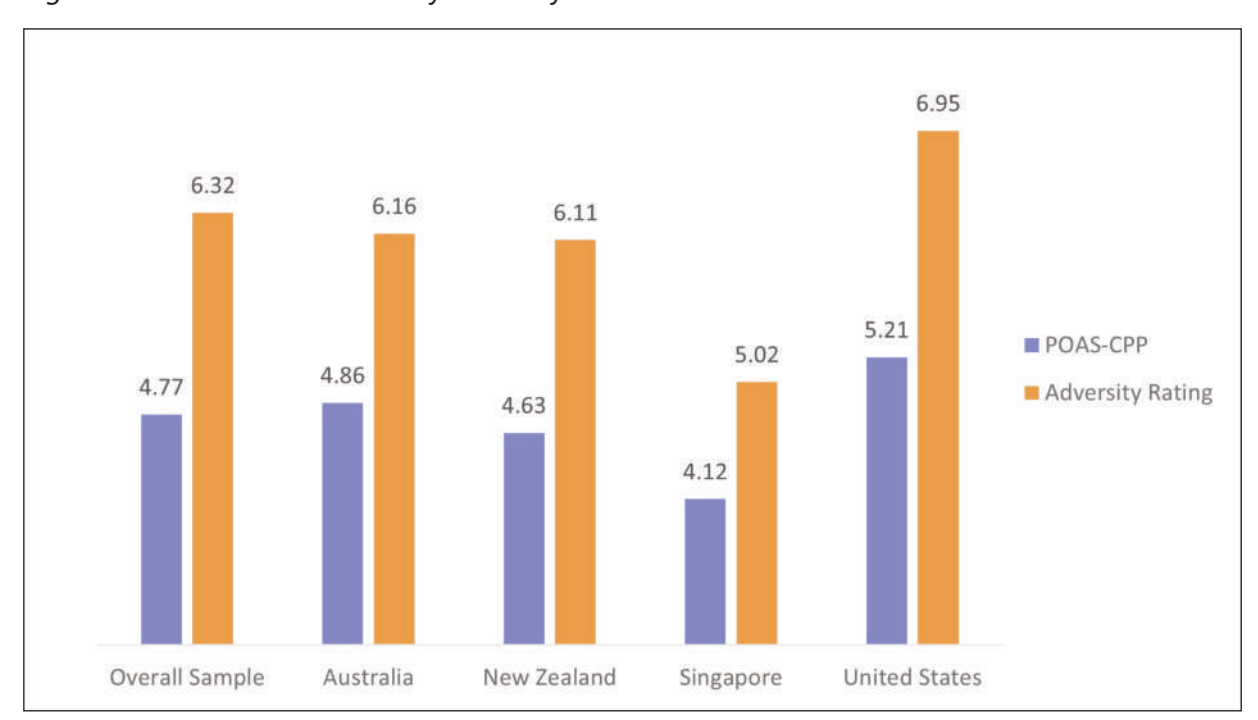
Figure 1: POAS-CCP and Adversity Scores by Jurisdiction

In addition to the above, an examination was conducted on the POAS-CCP sub-scale scores to provide further insight into which specific wellbeing challenges were most, and least, predominant for each of the four jurisdictions. Analysis indicated that, although participants are being impacted by the perceived occupational adversity of their profession, there is an identifiable difference in the profile of the specific challenges which are most prevalent between jurisdictions. As indicated in