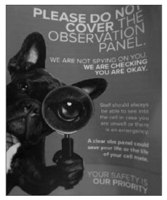
Figure 3: Procedurally Just communication door sticker, HMP Hewell

The importance of procedural justice has been written about extensively in the PSJ over the last few years. To avoid repetition, I will just note that there is strong and consistent evidence supporting the impact of procedural justice on both prison safety<sup>10</sup> and postrelease success.<sup>11</sup> Procedural justice should not be considered a 'buzz word'. It is a way of delivering institutional processes that makes an enormous difference to cooperation, views of authority, behaviour and outcomes. We must actively work to improve the consultation, respect, neutrality and transparency with which we communicate decisions and procedures, both formally and informally. Procedural justice is rarely achieved by accident: it needs to be formally designed in to how we operate, and it feels cumbersome and strange to do this initially. Procedural justice is an essential component of how staff relate to prisoners how they convey decisions, make requests and so forth; but it is also necessary within the more formal systems of a prison, such as adjudications<sup>12</sup>, local written notices, administration of incentives schemes<sup>13</sup>, cell searching<sup>14</sup>, and offender management.<sup>15</sup> A number of