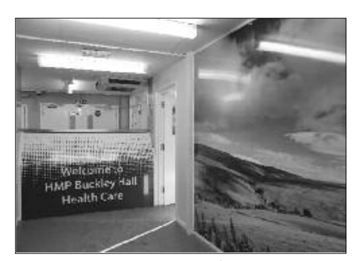
Figure 4: HMP Buckley Hall: Healthcare full wall mural

Many prisons have been experimenting with putting these ideas into practice. For example, HMP Berwyn took advice from Professor Dominque Moran in its set-up phase and as a consequence is designed with brightly coloured interiors and furnishings, making