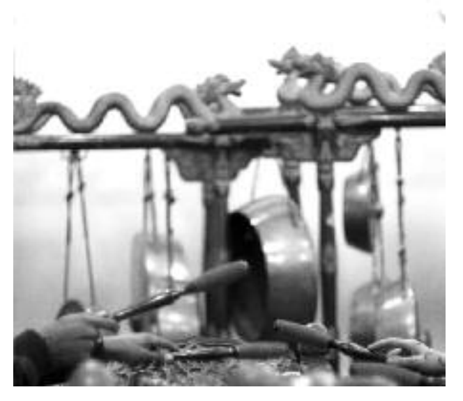
Image 1: In front of the gongs, a pair work with each other to create an interlocking pattern on the bonang (photo credit: Francois Boutemy , 2010).

Good Vibrations is a charity known for its use of gamelan music in criminal justice settings. The gamelan is an orchestra of percussion instruments from Indonesia, made up of various metallophones, xylophones, gongs and drums. You can see and hear one at HMP Peterborough here: https://www.goodvibrations.org.uk/watchsome-clips/watch-a documentary-on-a-typical-gamelan-in-prison-project/