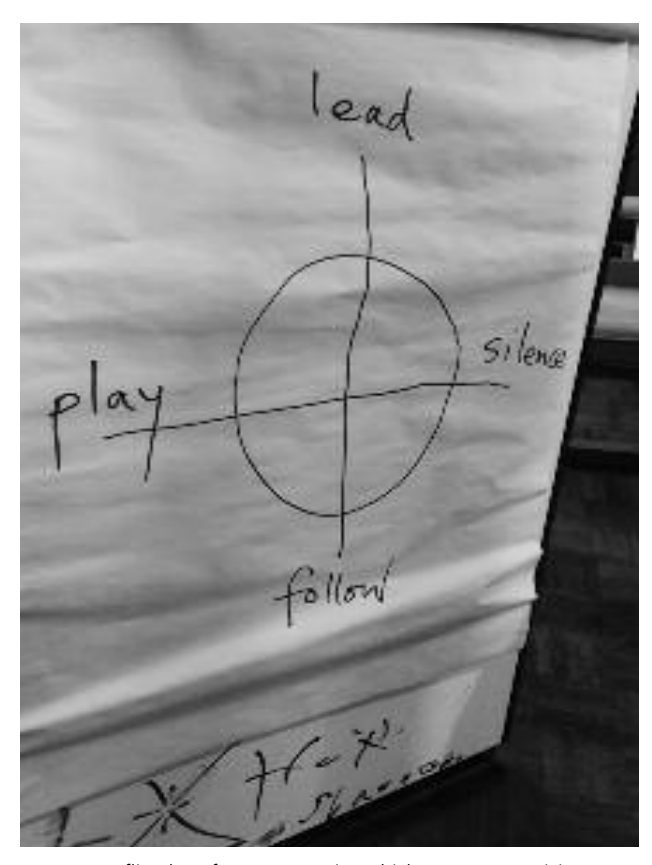
Image 2: A flip-chart from an exercise which supports participants to explore social dynamics through the safe lens of music (photo credit: Gigi Chiying Lam , 2016).