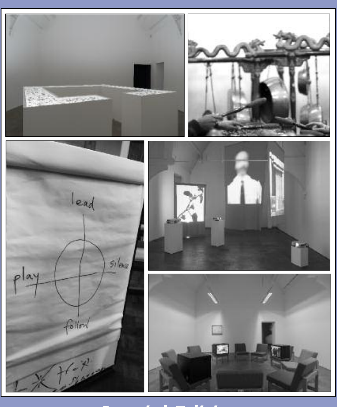
Special Edition The Arts in Prison