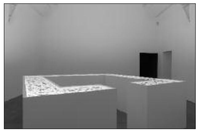
' Edmund Clark, courtesy Ikon Gallery, Birmingham

The installation 1.98m<sup>2</sup> is a lightbox shaped so that you can enter it and stand inside or outside. It's covered with flowers that have grown inside the perimeter at Grendon that I've picked and pressed between sheets of prison paper towels under books in my office.