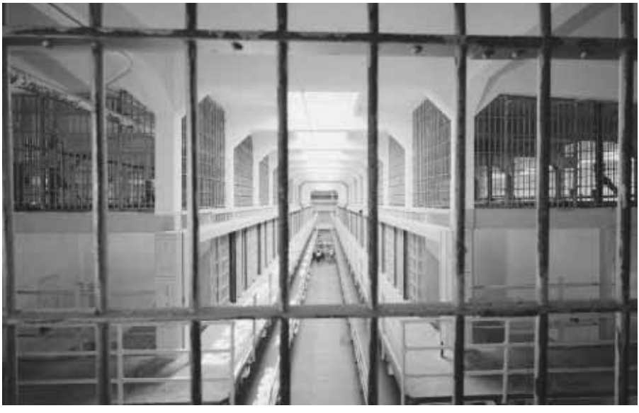
Figure 1: View looking south from third level guard station. Cell Block 'B' on the left, and Cell Block 'C' on the right. Alcatraz Island Federal Penitentiary, California. (US Library of Congress, Historic American Buildings Survey, California [HABS CAL, 38-ALCA, 1-A-20]).

steel and concrete façade (Figure 1). A landscape of complete surveillance, iron bars (and later, clear reinforced plastic) replaced solid cell doors, and freestanding watch towers guarded the fortified perimeter boundaries. In a stark departure from the optimistic rehabilitative philosophies of the nineteenth century, these 'total institutions'<sup>4</sup> were designed to enforce imprisonment as a painful form of civic retribution. Currently in operation, Leavenworth Penitentiary, Kansas (1895) continues to serve as the largest American maximum-security facility, with approximately 2,000 male inmates incarcerated.