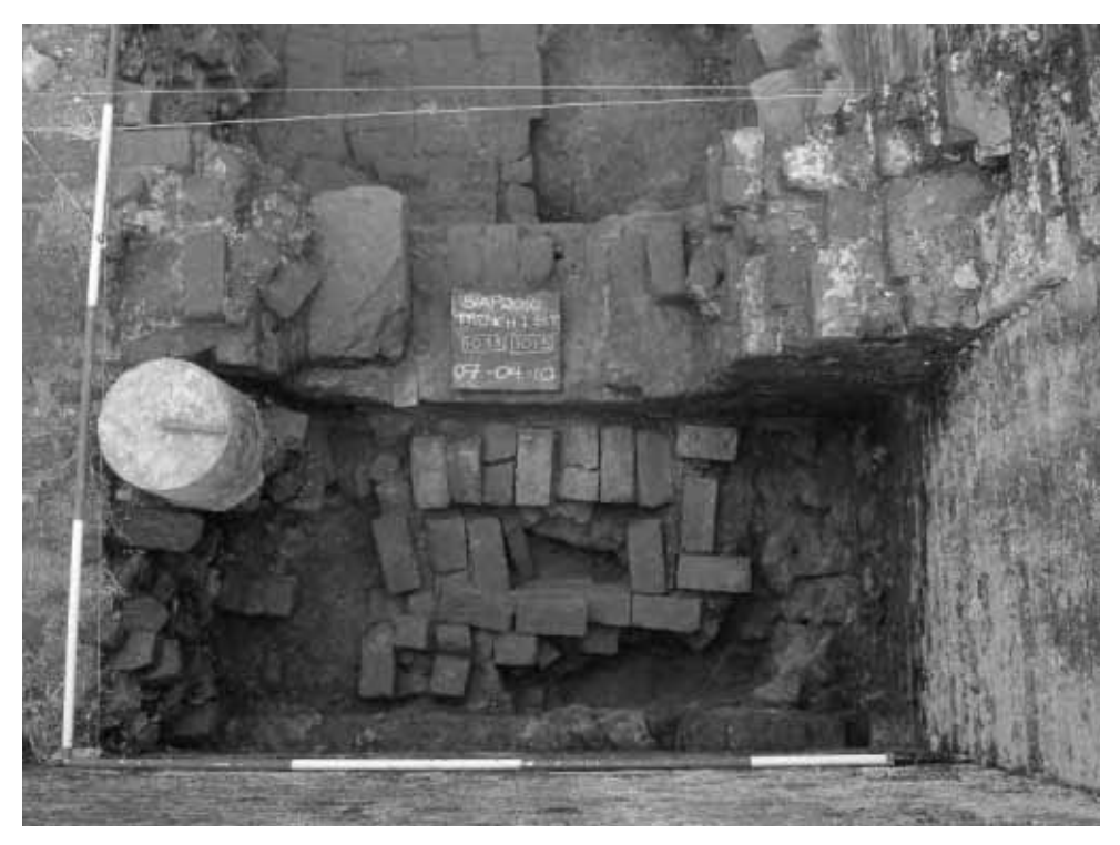
Figure 2: Detail of modified cellblock and recycled brick features, Gaol interior. Sarah Island Archaeology Project, 2010.

the remote west coast of Van Diemen's Land (Tasmania), exposed a particularly impressive negotiation of disciplinary architecture inside the establishment's Gaol. Constructed by 1827 for the solitary punishment of secondary offenders, this brick structure originally contained a row of six isolation cells along an access corridor, each measuring 7 foot (2 metres) by 3 foot (1 metre), with floorboards and ceiling height of 9 foot (3 metres). The single entrance to the Gaol was located in the short eastern face of the structure, and opened into a large timber-floored guard room at the front of the building.