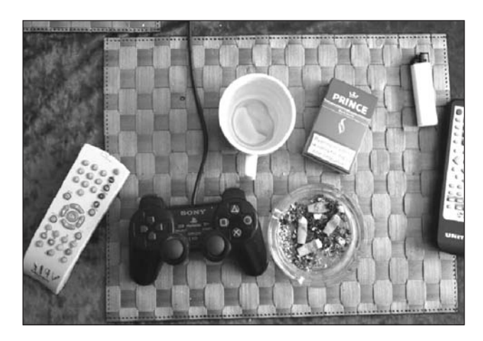
The left picture illustrates the life of a prisoner before the initiative, where an ashtray, an empty coffee cup and a play station were a major part of life. The right picture illustrate the life after the initiative was launched, where inmates and staff — together — engage in psychical training, health and nutrition counselling, and various sport activities.

At one maximum security prison facing exactly the wicked challenges mentioned above, we starting a user-driven process where inmates together with guards began discovering the secrets of a meaningful daily routines. Both inmates and staff were bored, but a few inmates and guards were more active during the day than the others. These individuals managed to cope and get by despite the inherent systemic barriers. Together with a group of both other inmates and guards they began applying and developing new behavioural routines and activities during the day that created more energy and life in the prison, for example a 12 week health and nutrition programme including physical training — together. Though this might seem banal and almost simplistic, it was not done before in a wider scale for larger groups of inmates and staff. It has created new energy and meaningfulness for both