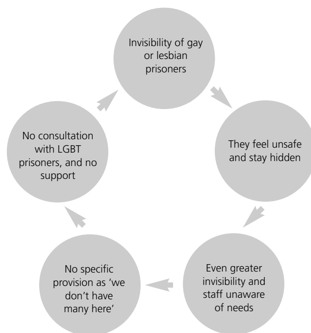
Figure 1: the cycle of invisibility.

The invisibility of gay and lesbian prisoners is compounded by the heterosexist tendency of some staff to perceive being gay, rather than homophobia, as the problem. During a recent inspection we talked with an Iranian gay man who was facing deportation at the end of his sentence. He was fearful of being killed on his return to Iran and he had asked staff for help in contacting organisations that had experience of supporting Iranian gay men. A letter the diversity senior officer had written to him concluded: 'If I can be of any further help to you with problems arising from your homosexuality please do not hesitate to ask.' He told us how upset he was about that phrase, which expressed the officer's failure to understand that his problem was