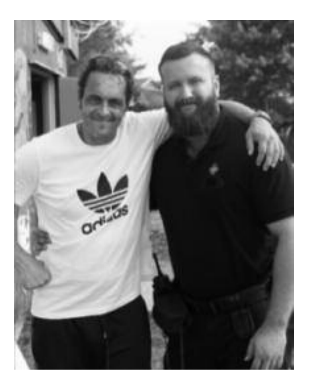
eight performances to residents, staff (and their families) and the local community. The event raised over £1000 for charity and the evaluation of the event highlighted how it brought a sense of community and