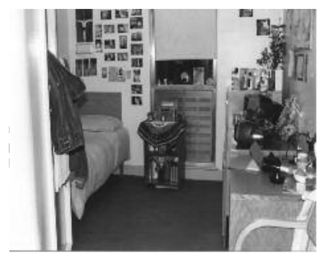
Fig 3. From a woman's room in The Dóchas Centre, Mountjoy Prison, Dublin