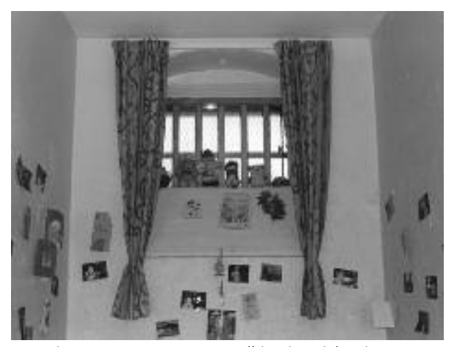
Fig 1. From a woman's cell in Limerick Prison

Baldwin and Quinlan's studies found that, regardless of the widely varying individual circumstances, women who have experienced prison often describe the best and the worst of their emotions in the context of their own prison space; that is their cell or their room. No matter how stark or indeed how pleasant the room might be, that small space held powerful emotions.