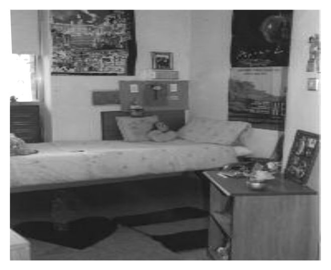
Fig 2. From a woman's room in The Dóchas Centre, Mountjoy Prison, Dublin

This woman worried that she might die in her cell, being fearful that her suicidal thoughts would eventually overpower her. She wrote her fears in her journal, as a series of poems, one of which is presented below: