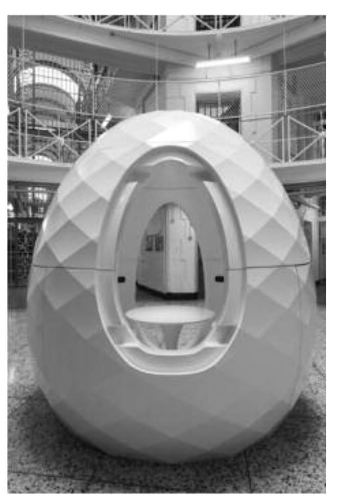
Rear view through evacuation hatch.

Potential drawbacks of seedS might fall into three areas: confidentiality, staff and prisoners response to seedS and security. Medical confidentiality will require management; the visibility of prisoners attending appointments on the wing and the potential for others to make assumptions on their health issue could result in prisoners preferring not to attend appointments. Using seedS for a variety of purposes would improve privacy and reduce risk of stigma developing. Secondly, staff and prisoners may not 'take' to seedS. This might be due to their lack of knowledge of its purpose, lack of control over its use or for security reasons. Involving staff from all disciplines and prisoners in the introduction, uses and location of seedS in a new establishment increases their sense of ownership and control, empowering them to make utility decisions for seedS that best fit their particular service. Finally security is the principal factor in all secure environments; for the safety of staff and prisoners. seedS was designed with input from staff and prison security, with security alarm and two exit points. Staff would be expected to follow standard security risk procedures as they would in any other treatment room.