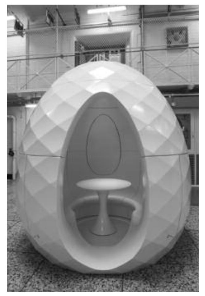
seedS in HMP Leeds August 2015.

Designed as a mobile therapeutic space for reflection, contemplation and self-development for prisoners and staff, seedS will enhance clinical provision within prison environments. Small and personal with a form taken from nature designed to protect and