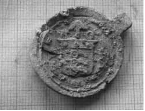
Figure 3: Detail of excavated lead bale seal, Ross Factory Archaeology Project, 2007. Left: artefact (special find 20) after conservation treatment. Right: artefact after field recovery.

Alternatively, the frequency and sheer diversity of sewing-related artefacts within this assemblage also suggested a degree of quiet circumvention of the strict separation between the Nurseries and adjoining Work Room. While temporarily accommodated with their infants before enforced weaning, convict mothers were not required to undertake official taskwork duties. After