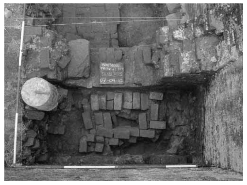
Figure 2: Detail of modified cellblock and recycled brick features, Gaol interior. Sarah Island Archaeology Project, 2010.

the remote west coast of Van Diemen's Land (Tasmania), exposed a particularly impressive negotiation of disciplinary architecture inside the establishment's Gaol. Constructed by 1827 for the solitary punishment of secondary offenders, this brick structure originally contained a row of six isolation cells along an access corridor, each measuring 7 foot (2 metres) by 3 foot (1 metre), with floorboards and ceiling height of 9 foot (3 metres). The single entrance to the Gaol was located in the short eastern face of the structure, and opened into a large timber-floored guard room at the front of the building.