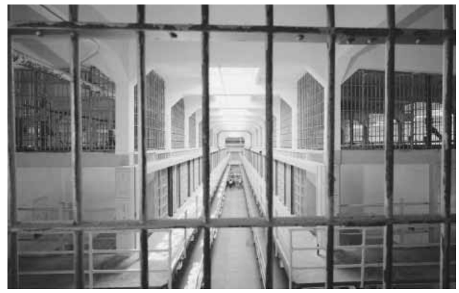
Figure 1: View looking south from third level guard station. Cell Block 'B' on the left, and Cell Block 'C' on the right. Alcatraz Island Federal Penitentiary, California. (US Library of Congress, Historic American Buildings Survey, California [HABS CAL, 38-ALCA, 1-A-20]).

steel and concrete façade (Figure 1). A landscape of complete surveillance, iron bars (and later, clear reinforced plastic) replaced solid cell doors, and freestanding watch towers guarded the fortified perimeter boundaries. In a stark departure from the optimistic rehabilitative philosophies of the nineteenth century, these 'total institutions' were designed to enforce imprisonment as a painful form of civic retribution. Currently in operation, Leavenworth Penitentiary, Kansas (1895) continues to serve as the largest American maximum-security facility, with approximately 2,000 male inmates incarcerated.