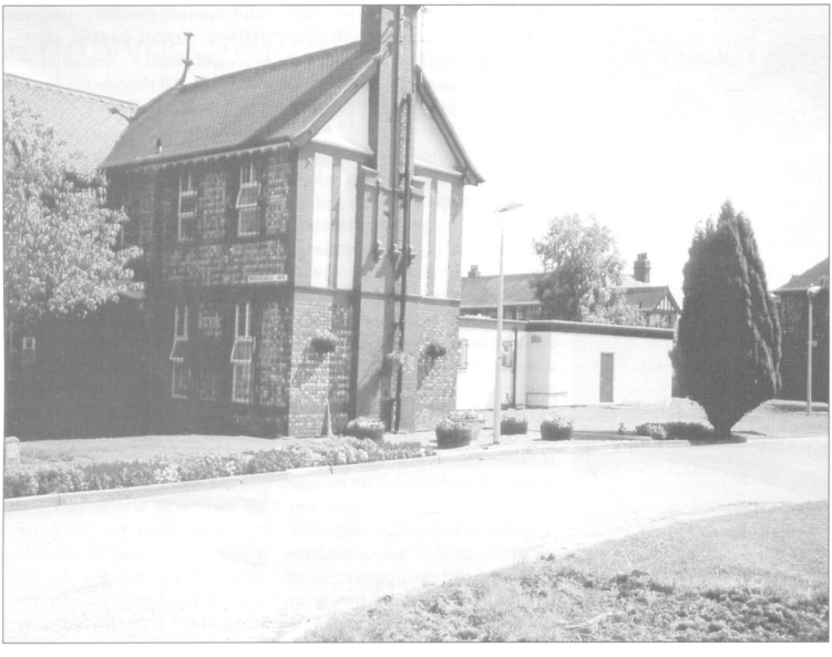
Reeman Unit, HMP Styal

therapeutic and the colours will absolutely all over the place. stimulate the mood, as will the music. For some of our women who aren't able to verbalise to a great degree - and that's not saying they've got a learning disability, but they might not have been encouraged to verbalise in the past - they can actually start to experience stimulants that are different from perhaps drugs or alcohol. Things that will make you feel good other than chemicals. It would be a brilliant feature to have, so we're lobbying for that at the moment.