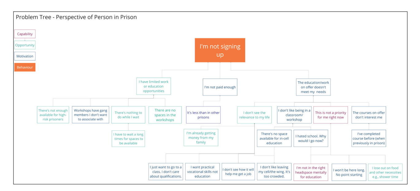
Figure 1. An example problem tree on why people weren't signing up for ESW

Researchers spoke to 68 prisoners and 40 staff, and synthesised the data into problem trees, which showed whether the barrier was capability, motivation, or opportunity (see figure 1). Problem trees were produced from the perspective of staff and prisoners. These trees were used to show the breadth of barriers, the range of perspectives, and potential points where the prison could intervene to improve the situation. They were used in a co-creation workshop at each prison.